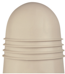
Alpha TruSeal Liner